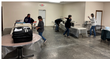
LARUE CO SNIP & CLIP