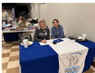
COMEDY TO THE RESCUE