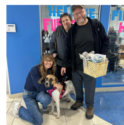
HARDIN CO HONDA ADOPTION EVENT